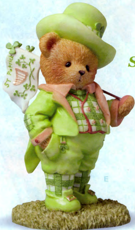
St. Patrick's Day The Luck O' the Irish